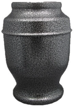
Thamesford Price: $120 Aluminum Gravure Craft UR 2009 Size: 8"H x 6"D

(Please, note a wider selection of urns are available on our web site and upon request)