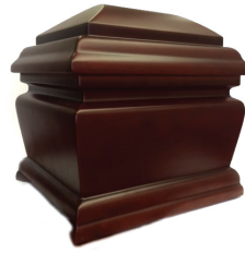
Bristol Price: $175 Rosewood Dodge 972353 Size: 8"H x 8.125L x 7"W