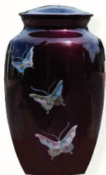
Pearl Butterfly Price: $325 Aluminum/ Mother of Pearl Gravure Craft UR 7124 Size: 10"Hx6"W