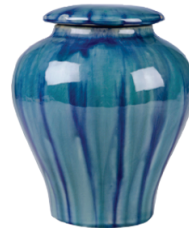
Spring Rain Price: $300 Ceramic Victoriaville US 550 - 0004 Size: 9.5H"D x 7"W