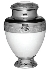
Elegant Pearl Price: $260 Metal Maritime US210-30048 Size: 10"H x 7"D