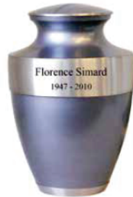
Starlight Price: $270 Metal Victoriaville US430-05201 Size: 6"W x 10"H