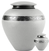
Shimmering Grey Price: $265 Metal Dodge 941900 Size: 8.5"D x 7.3"H