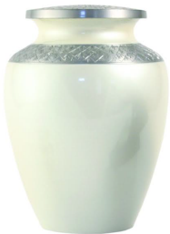
Celeste Pearl Price: $180 Alloy Dodge 941801 Size: 9"Dx6"H