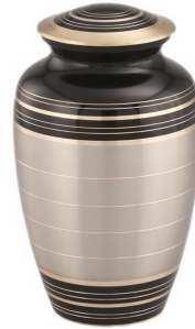
Pewter Black Price: $250 Metal Victoriaville US210-3001 Size: 6"D x 10"H