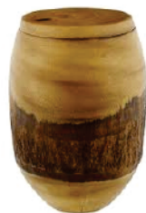
Mangowood Price: $330 Mangowood Gravure Craft UR 7200 Size Varies