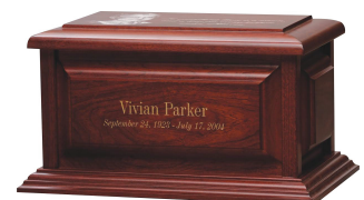
Fairmont Cherry Price: $425 Cherry wood Eckels 3523 Size: 11.9"Wx7.4"Dx6.25"H